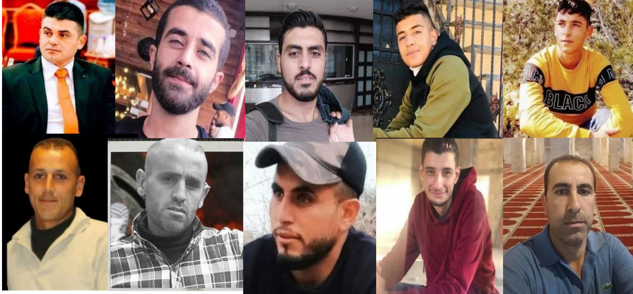
The pictures and names of the ten Palestinians killed near Beita between May 2021 and May 2022

against the Evyatar colonial outpost, and the tenth was a plumber, killed as he was trying to raise the water level at a well to circumvent water shortage on Beita.